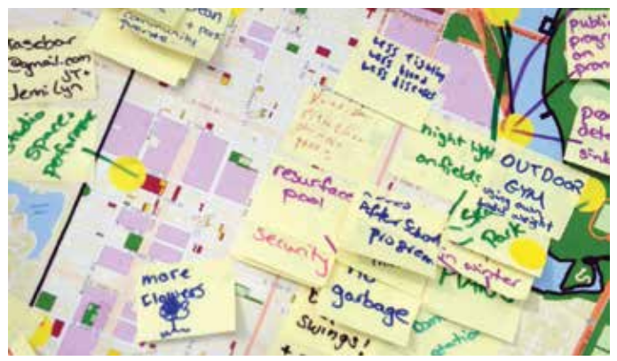
East Harlem residents relied on our research and data when choosing their priorities for rezoning

Another area facing rapid change is Brownsville, Brooklyn, currently undergoing a neighborhood planning process