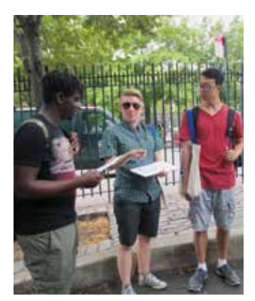
NY4P staff and interns train El Puente's Summer Youth Employment Program participants how to collect data on their open spaces