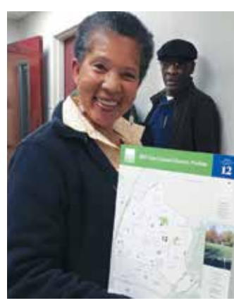
A park advocate holds an NY4P City Council District Profile at our "How's Your Park, NYC?" meeting in the Bronx

At our citywide meeting, held in early spring, we discussed the city's proposed fiscal year 2017 parks budget with attendees, providing a detailed explanation of the budgeting process so that advocates are better able to understand and